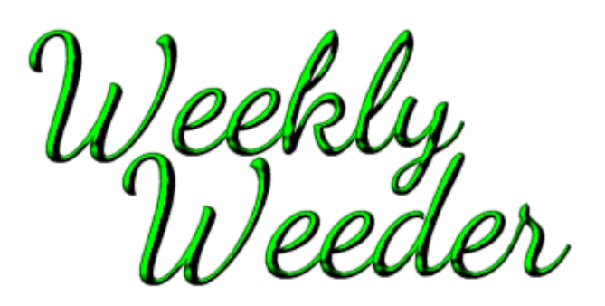
June 16, 2022 News Content