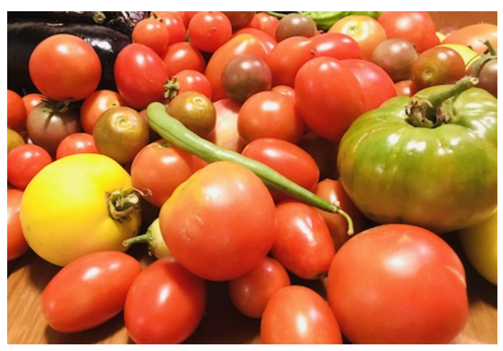
Tomato harvest 3-4 years ago from a plot that produced a few gun golds this year