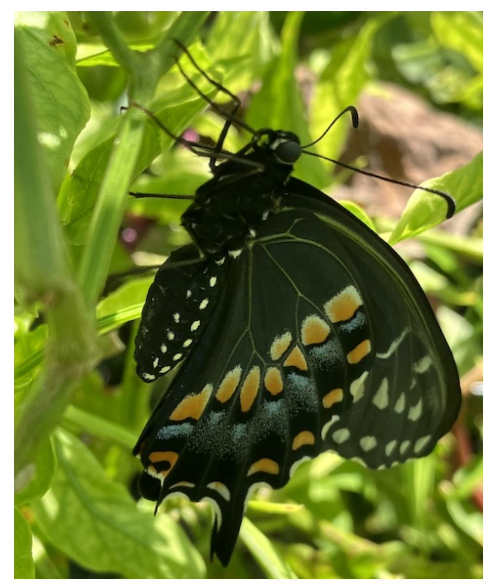
Black Swallowtail by Maria Beach