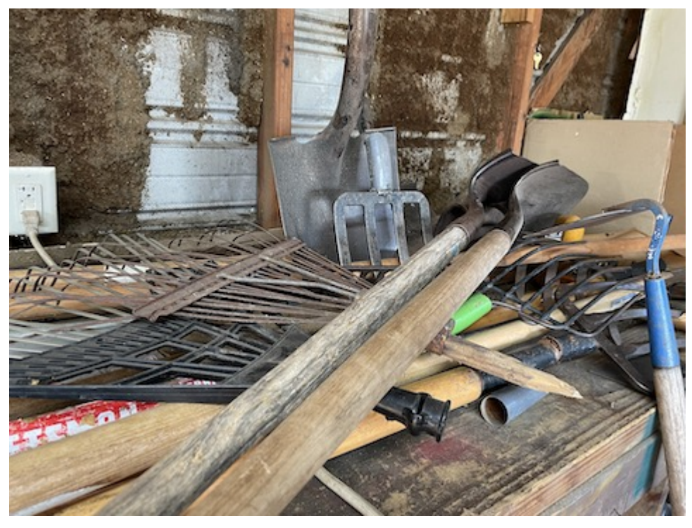
Tool "graveyard"