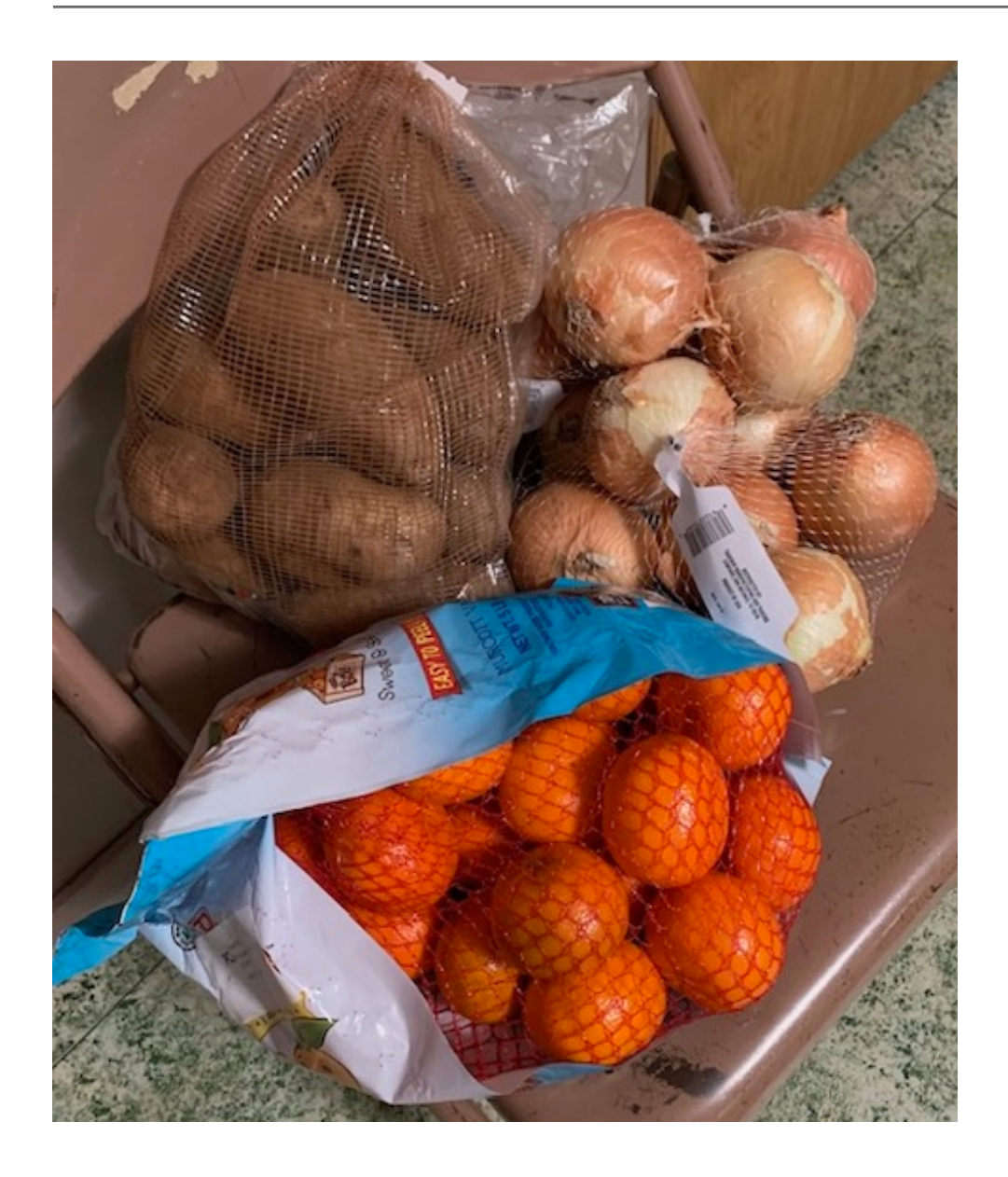
February & Year-to-Date Sunshine Donations to Micah 6 Food Pantry