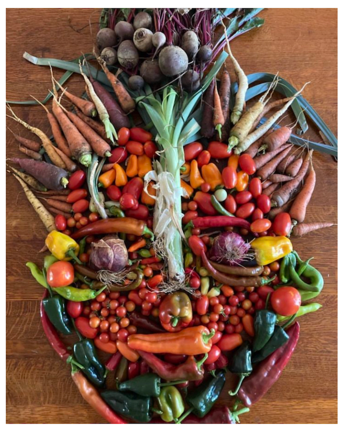
7/17/23 Harvest by Kerry Drake