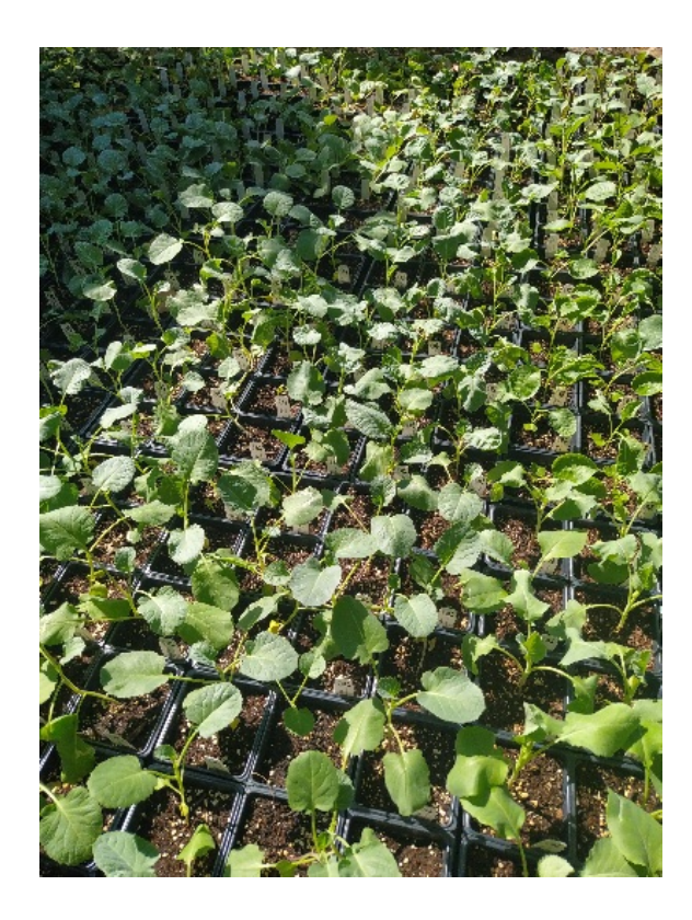
Photo taken today of plants grown for the upcoming plant sale.

[NB: Sawubona & Dia duit are global ways to say hello. The first is Zulu and means we see you, and the latter is Irish and literally means God to you.--Editor]