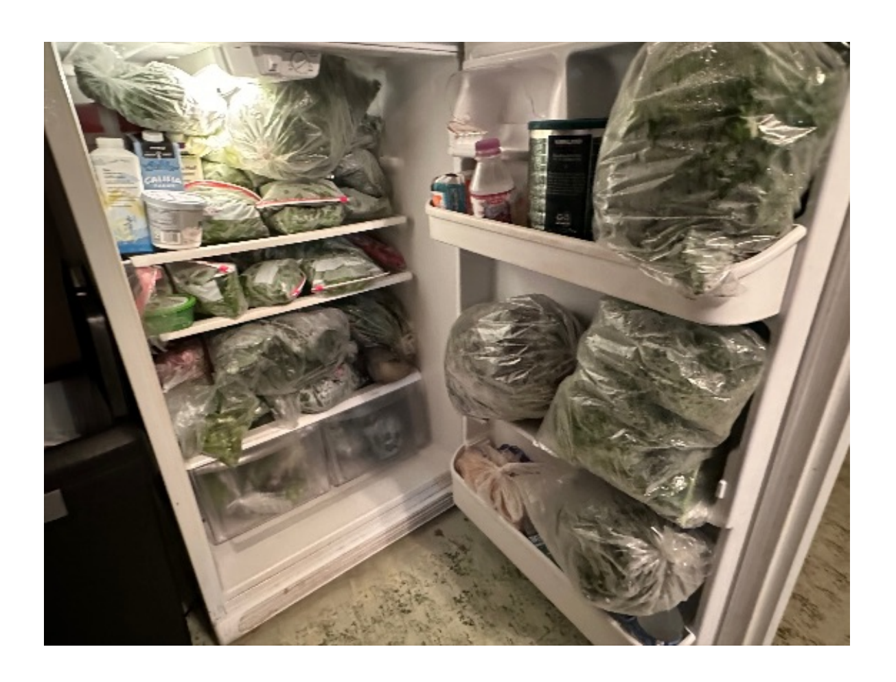
The trailer refrigerator was filled to capacity with greens for Micah 6 recently.